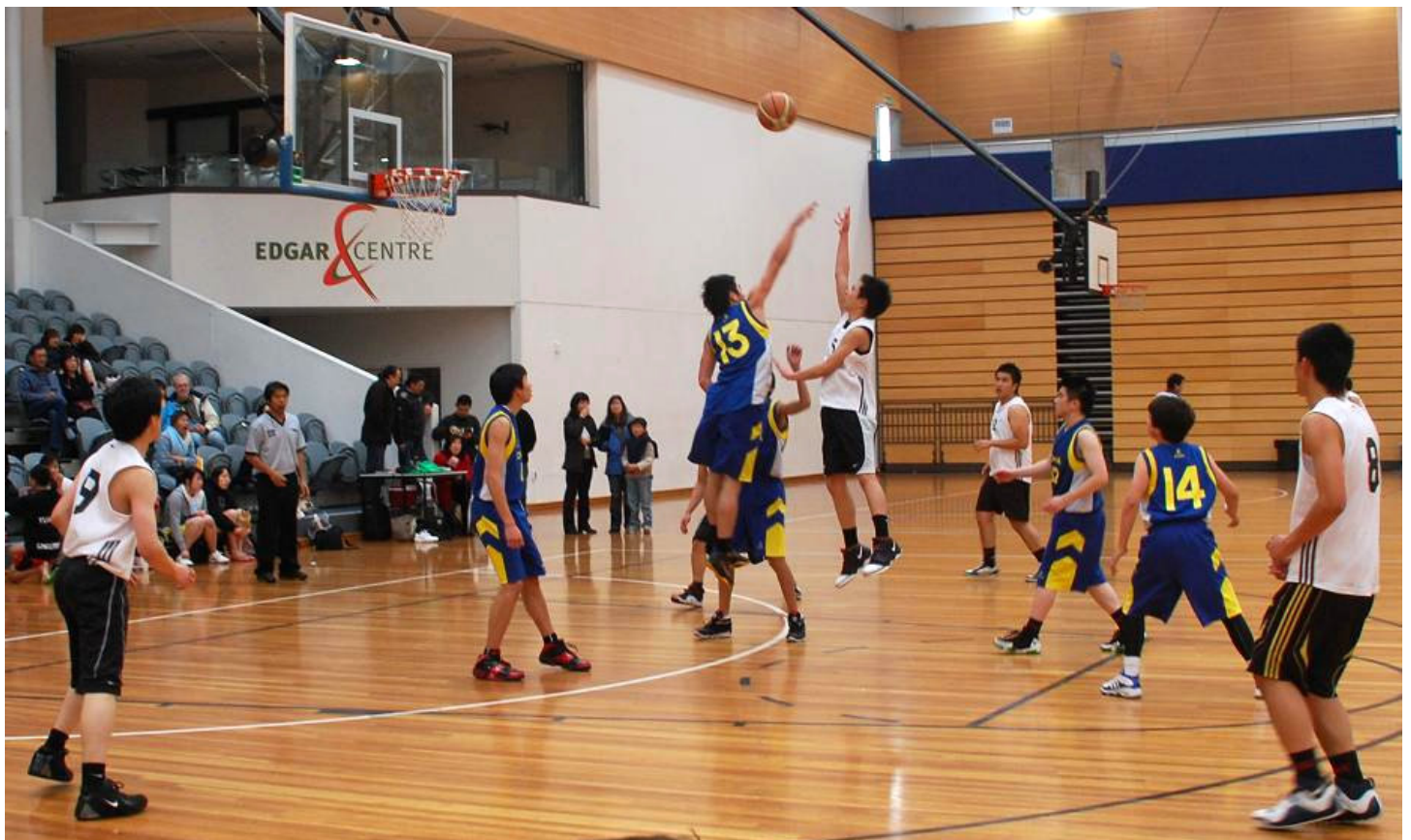
OSCA vs Canterbury, High School Boys – South Island Chinese Basketball Tournament, Sunday 27 Sept 2009