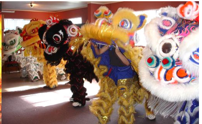
Lion Dance Workshop – 22, 23 August 2009