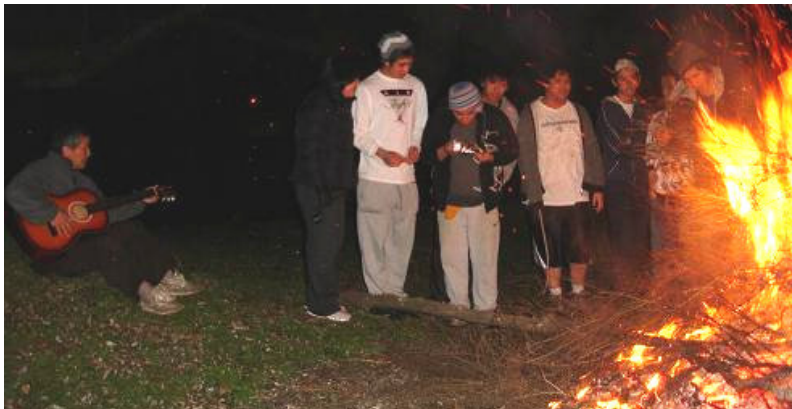
OSCA Annual Camp – 28-30 August 2009