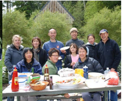
The committee carries on unperturbed