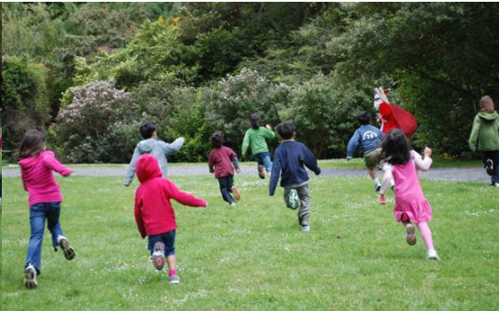
The kids give chase.....