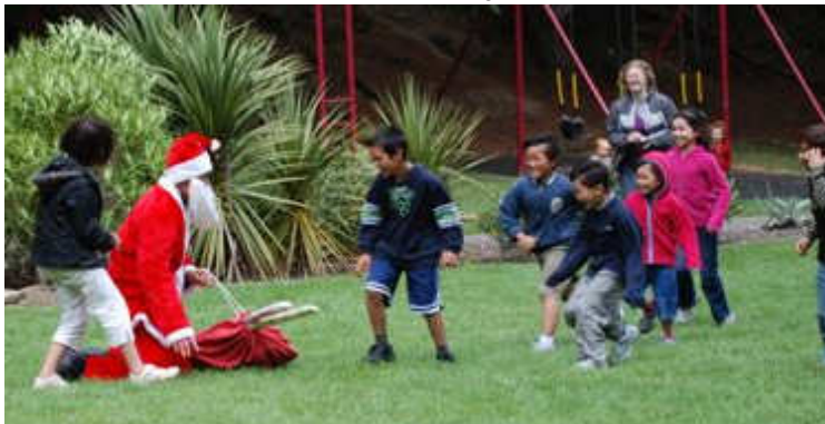
He's down.....but don't worry he's okay to give out presents!