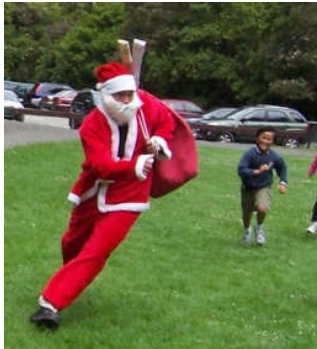
Santa arrives and is off....