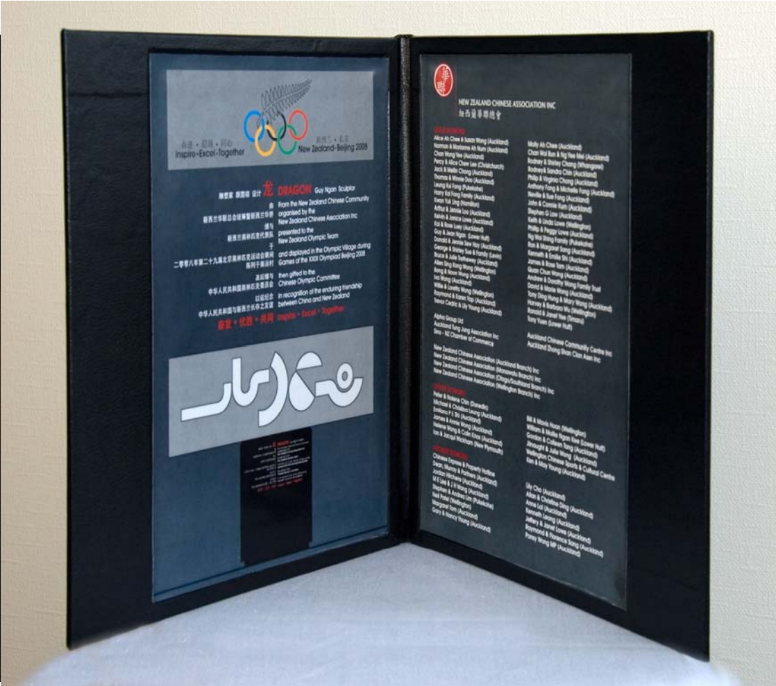
OLYMPIC DRAGON Gift Book by Wah Ying Chong