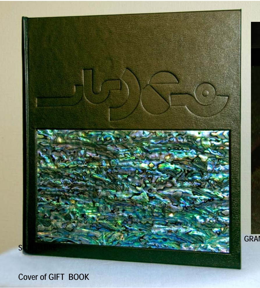
Cover of GIFT BOOK