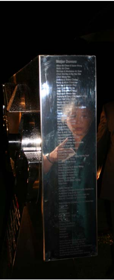
Donor's Names on Sculpture