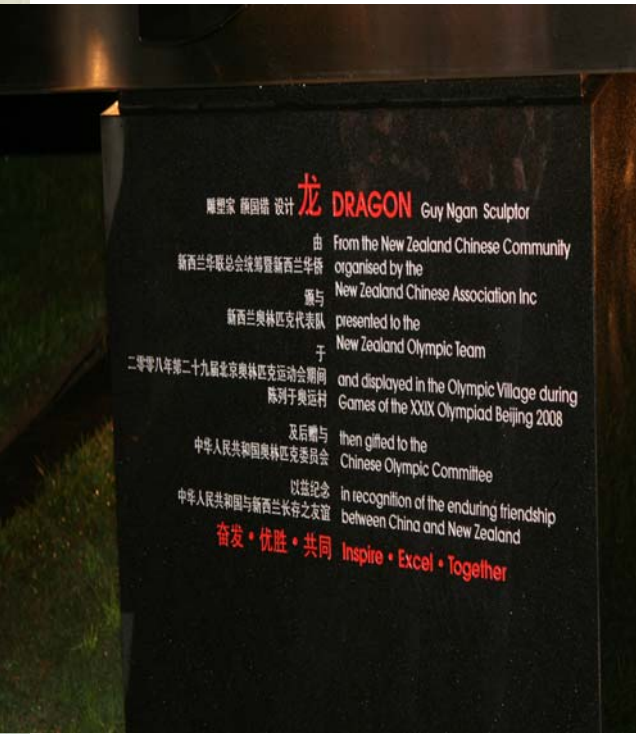
GRANITE BASE of OLYMPIC DRAGON