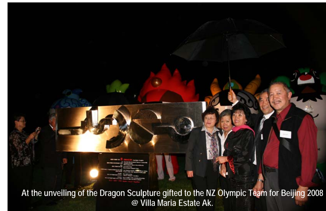
At the unveiling of the Dragon Sculpture gifted to the NZ Olympic Team for Beijing 2008 @ Villa Maria Estate Ak.