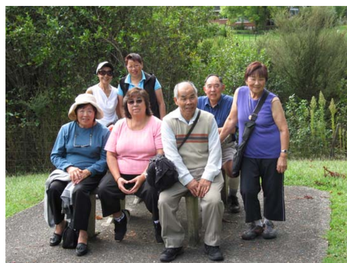
Happy NZCA Members taking a rest @ Warkworth