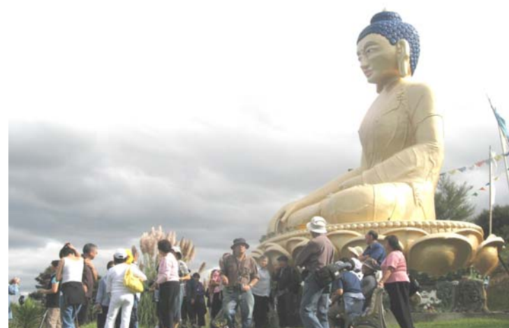
Karma Choeling Buddha --